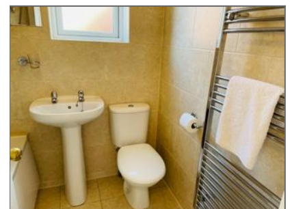
Bathroom / W.C