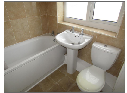
Bathroom / W.C