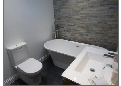
Family Bathroom / W.C