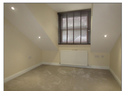
Bedroom Four/cinema/study Room