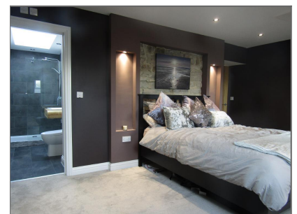
Additional Master Bedroom